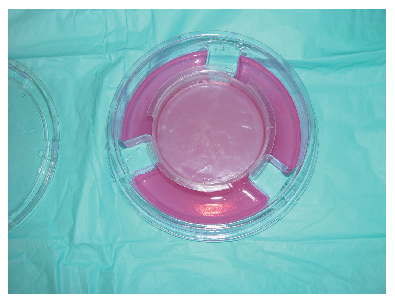
Figure 1 Apligraf® as it is received from the manufacturer. Note that the epidermal side is dull-appearing and facing upwards.

Prior to application of Apligraf, the wound bed should be optimized, a term that has been called "wound bed preparation." For VLU, wound bed preparation consists of debridement of any slough, necrotic, and possible fibrotic material. For DFU, wound bed preparation begins with sharp debridement to remove, not solely the debris, slough, and necrotic tissue within the wound, but also all of the calloused tissue surrounding the ulcer. Apligraf should not be applied to infected wounds.